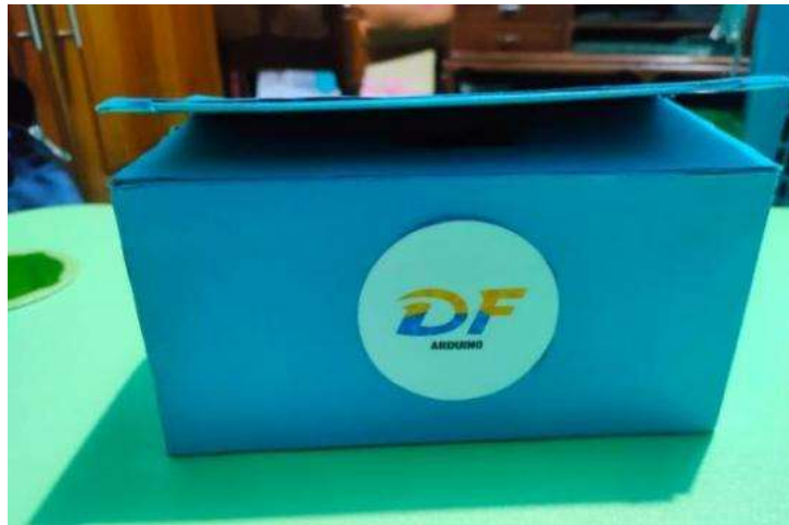
Figures 5 Exterior Prototypes