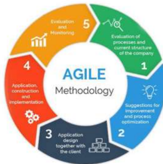
Figures 1 Agile Method

a. System planning is one of the initial stages in the categorization process which requires a step or stage.