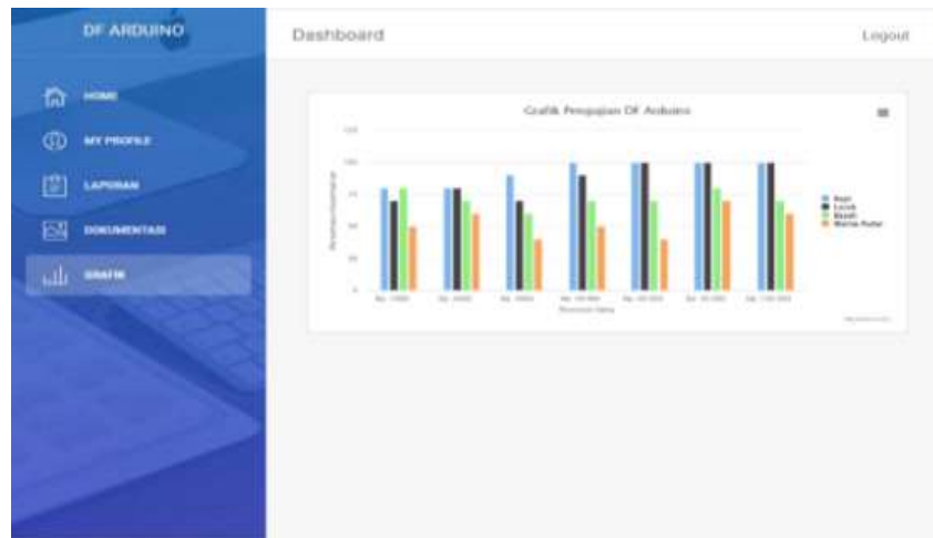
Figures 4 Graph Pages

This graphic page is a page provided for admins to view graphs from testing prototypes of banknote nominal detectors which function to make data presentation easier to see.