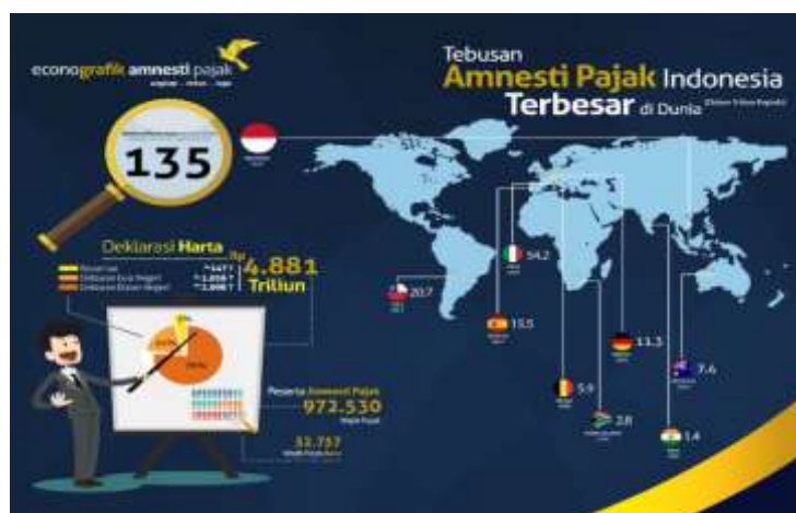
Picture1.1 Econographic ransom of tax amnesty at Indonesia (2018)

The following is an infographic that shows the superiority of the Indonesian Tax Amnesty contained in other countries.