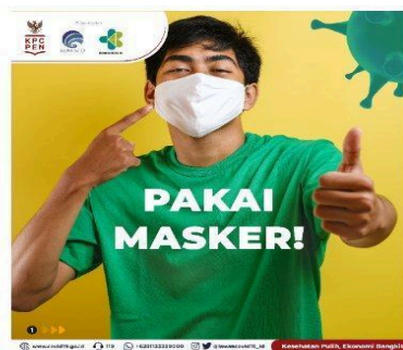
Figure 2. Data 1

The result of the study was obtained from the analysis of each poster in terms of their two signs system of poster, image and linguistic sign to get their meanings. Furthermore, the analysis is presented to get a cultural message conveyed in each detail of the poster.