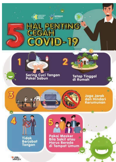
Figure 5. Data 4

So, the contextual meaning contained in the poster is that we follow the recommendation from the government (NAKES) to stay at home doing all activities, including work and so on, by leaving us (NAKES) to work outside.