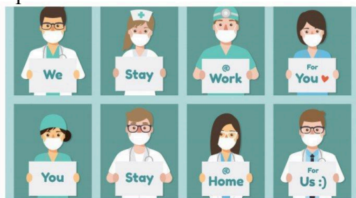
Figure 4. Data 3

Last, the contextual meaning contained in poster 2 is that we follow the government's recommendation to stay at home doing all activities, including work, while continuing to implement health protocols such as using masks and washing hands (pictured there are masks and sanitizers), so that we avoid accidents. exposure to the covid-19 virus.