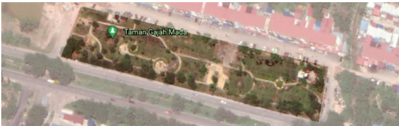
Figure 1. The Case Study Site: Taman Gajah Mada

Moreover, this research interviewed one respondent from each category – relaxation, interaction, and affiliation – who were chosen by purposive sampling to represent the sampled population's perception towards green spaces amid the COVID-19 crisis.