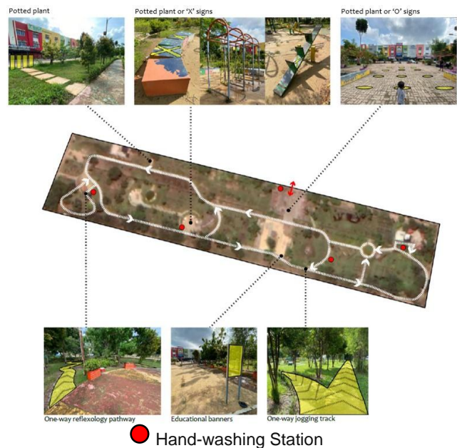
Figure 4. Circulation and furniture settings