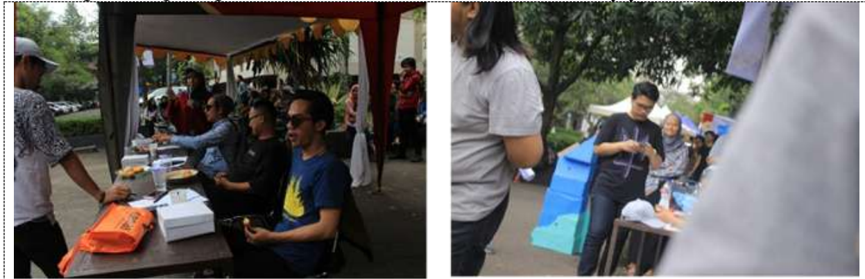
Figure 3. Facet of public open space event in a parking lot (source : survey and research result, 2018)