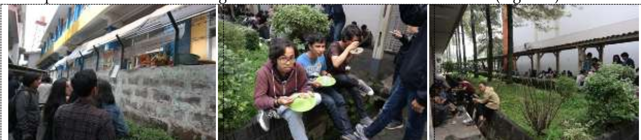
Figure 5. Illegal stimuli causing the circulation pathway changing function into a facility

In Itenas, there are some spots changing their function from as circulation pathways into commercial public open spaces due to the existence of a place that is actually considered as an illegal café. The designs of these spots actually do not support the illegal function. However, since the food sellers provide cheap and good food, the buying and eating activities occur in these areas. Some pictures taken in these illegal café found in Itenas are shown below (Figure 5).