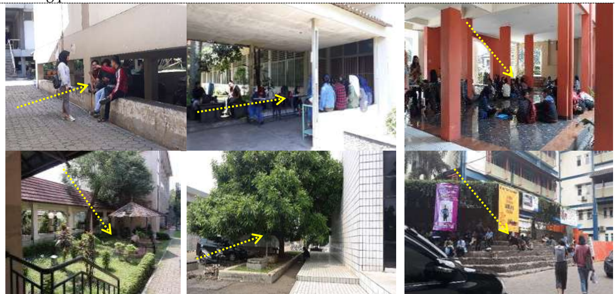
Figure 2. Some preferred spots in open spaces of Itenas and comparative campuses

Another result from the observation data analysis is the criteria of the elements/features and design preferred by the students in public open spaces. In terms of the design elements, it appeared that students prefer dual - function separating walls. It is because in addition to their function as separators, these + 1 meters high walls turn out to serve as seat as well. In other cases, some students place an unused bench and/or lecture table in the area that they consider convenient as a hangout-interacting place.