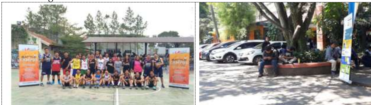
Figure 4. Activity and users in the communal open space and commercial facilities are heterogeneous